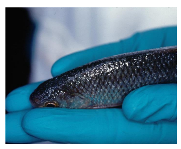
Roach with a heavy whitespot infection

Whitespot is very damaging to the gills and skin. In heavily infected fish it can cause a rapid loss of condition, considerable distress and death. Infected fish have small white spots on the skin and gills and produce excess mucus, due to irritation. Whitespot causes most damage when entering and leaving the tissues of the fish. This can lead to the loss of skin and ulcers. These wounds can harm the ability of a fish to control the movement of water into its body. Damage caused to the gill tissue of an infected fish can also reduce respiratory efficiency. This means it is more difficult for the fish to obtain oxygen from the water, and becomes less tolerant to low levels of dissolved oxygen.