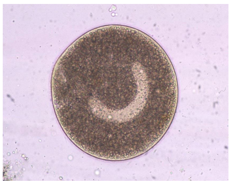
Whitespot viewed under a high power microscope

Whitespot is one of the most well-known fish diseases. It is caused by the parasite, Ichthyophthirius multifiliis . This single-celled organism is a common parasite that infects nearly all species of freshwater fish. Mature parasites are round or oval in shape and measure up to 1.5mm across. They feed on the blood and skin of the fish. The surface of the parasite's body is covered in small hair-like structures known as cilia. When viewed under the microscope, a characteristic horseshoe-shaped nucleus may be seen.